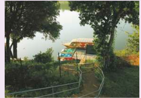
Boat Club, Shivpuri

Chhatris : Set in a formal Mughal garden, with quiet nooks under flowering trees, intersected by pathways with ornamental balustrades and illuminated by Victorian lamps, is the complex in which the cenotaphs of the Scindias are set. Facing each other across a water tank are the chhatris of Madho Rao Scindia and the dowager queen Maharani Sakhya Raje Scindia, synthesising the architectural idioms of Hindu and Islamic styles with their shikhara-type spires and Rajput and Mughal pavilions.