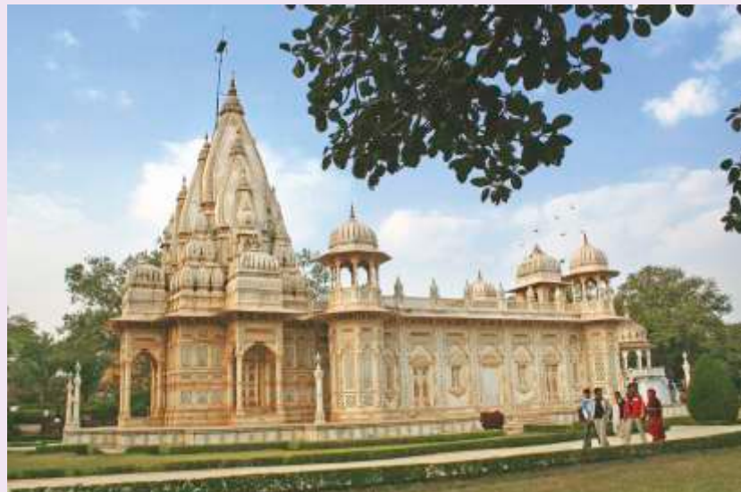
Madhav Rao Scindia Chhatra

The National Park is equally rich in avifauna; the artificial lake, Chandpatta, is winter home of migratory geese, pochard, pintail, teal, mallard and gadwall. A good site for bird watching is where the forest track crosses the wide rocky stream that flows from the Waste Weir. Species that frequent this spot are red-wattled lapwing, large-pied wagtail, pond heron and white-breasted kingfisher. The avifauna also includes the cormorant, painted stork, white ibis, laggar falcon, purple sunbird, paradise flycatcher and golden oriole.