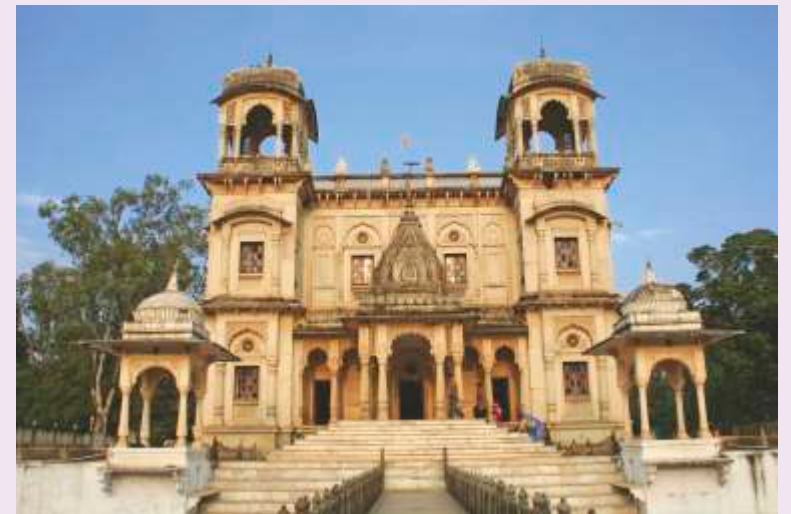
Maharani Sakhya Raje Scindia Chhatra

The glittering white marble surface of Madho Rao Scindia's cenotaph is inlaid in the pietra dura style, with lapis lazuli and onyx to create a spectacularly rich effect, heightened by the delicacy of the trellis work on the sides. The dowager queen's cenotaph has a noble dignity of line and superb structural harmony. Both memorials contain life-size images of the Scindias and these are tended to with extreme devotion by ceremonially-dressed retainers who perform the rituals of placing flowers and incense before the statues each day. In the evenings, the hush is broken by the sound of music as artists of the Gwalior gharana render classical ragas before the statues.